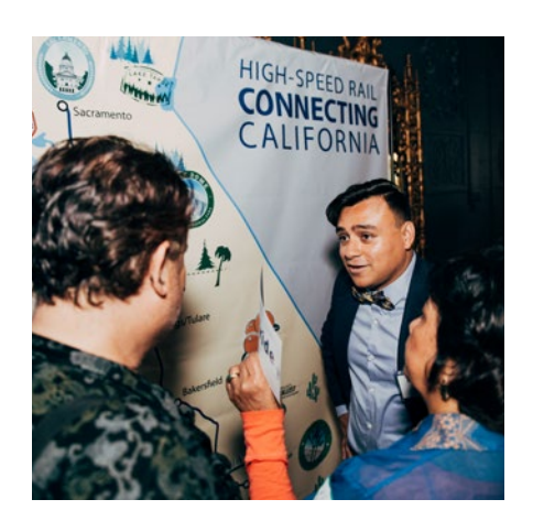
Exhibits at Climate Day LA engage citizens in discussion of public transit benefits in reducing vehicle emissions.